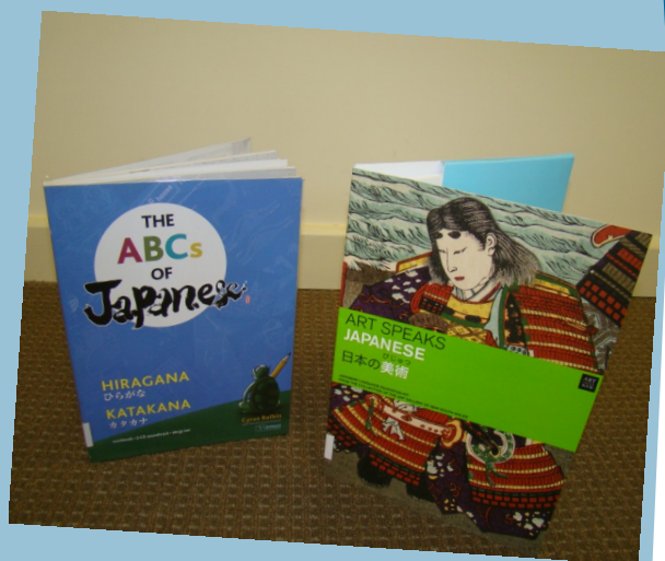
In the Japanese classroom